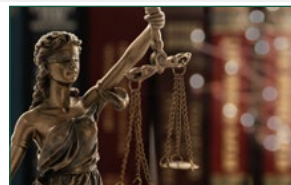
General & Products Liability