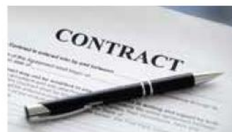
ERRORS AND OMISSIONS