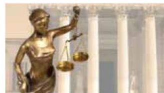
GENERAL & PRODUCTS LIABILITY